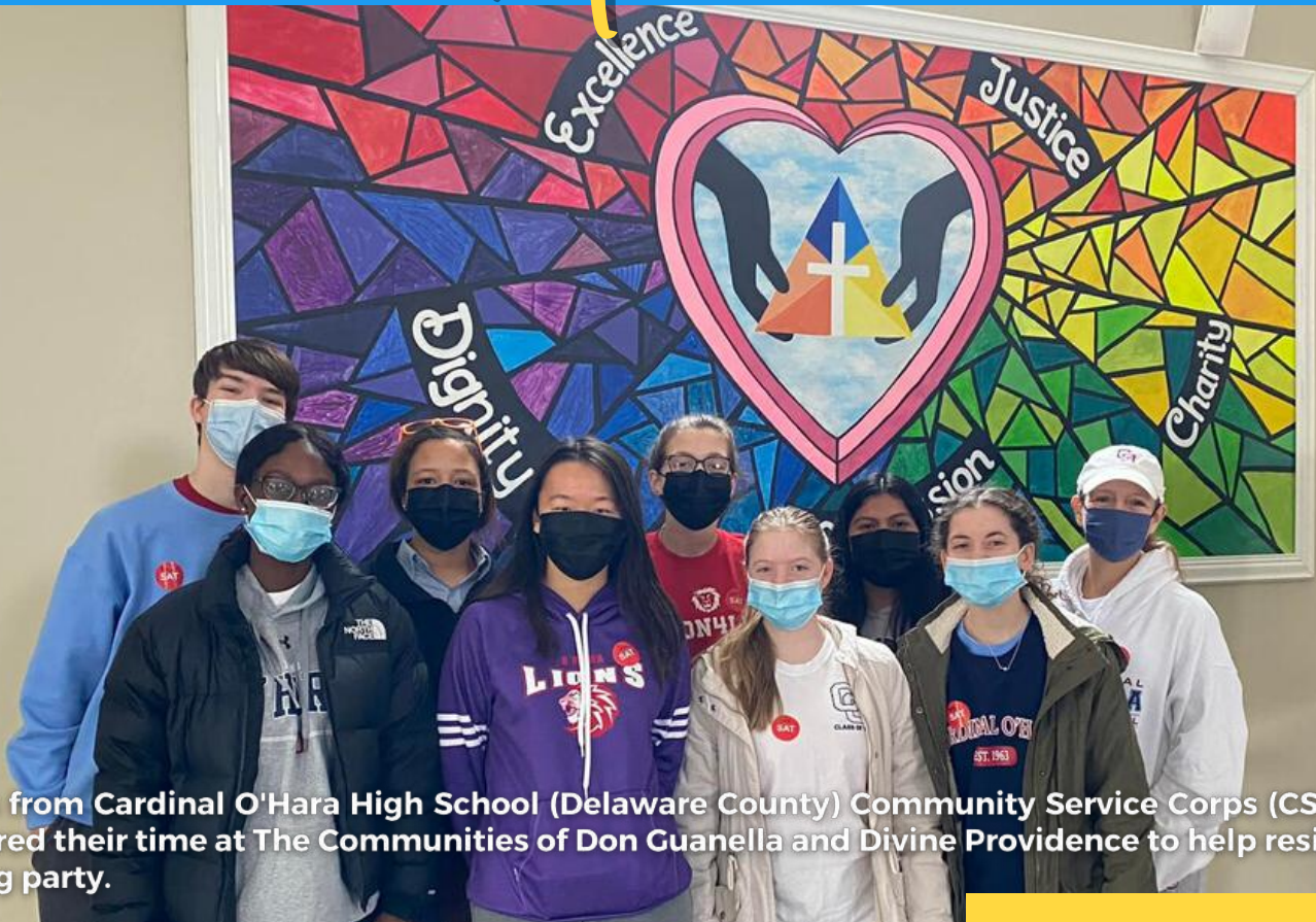
Students from Cardinal O'Hara High School (Delaware County) Community Service Corps (CSC) recently volunteered their time at The Communities of Don Guanella and Divine Providence to help residents with a painting party.

The Secretariat for Catholic Human Services of the Archdiocese of Philadelphia (CHS) is the largest faith-based human services provider in Southeastern Pennsylvania and benefits more than 300,000 individuals of all faiths annually.