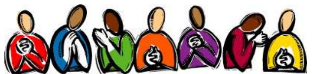
Lord, hear our prayers.

May the Lord Jesus bring all our loved ones into His Kingdom.